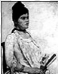
"The Goddaughter" by Giovanni Fattori, 1889