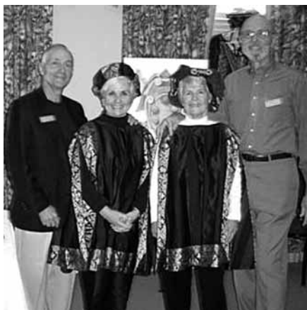
I Medici e il Rinascimento I Signori Diorio e Luconi

I n November ICS introduced its popular wine tasting series which regularly attracted capacity crowds. Also new to the calendar was the expansion of the Serie Culturale which features lectures on a variety of topics. These were also extremely well attended and were preceded by an elective brunch at Stonebridge Country Club. The opera and film series were continued from prior seasons. Besides traveling to Miami's new Ziff Opera House to see Aida , we were able to enjoy opera performances by Naples Opera right here at home. The Cinema Italiano added a bit of excitement to its usual format by starting group discussions about the films following the showings. The ICS Italian language program continued as usual and "ICS Travelers" was introduced with the formation of an internet-based information exchange site for travelers to Italy. So far 40